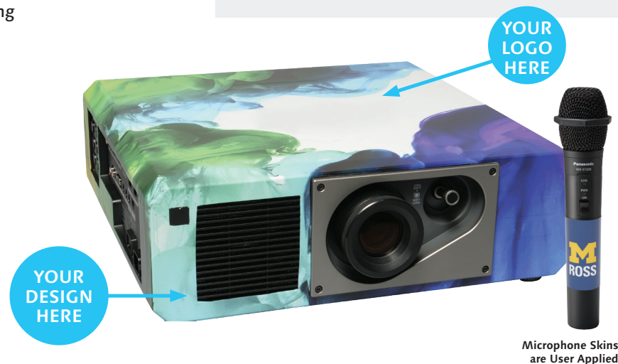
Microphone Skins are User Applied