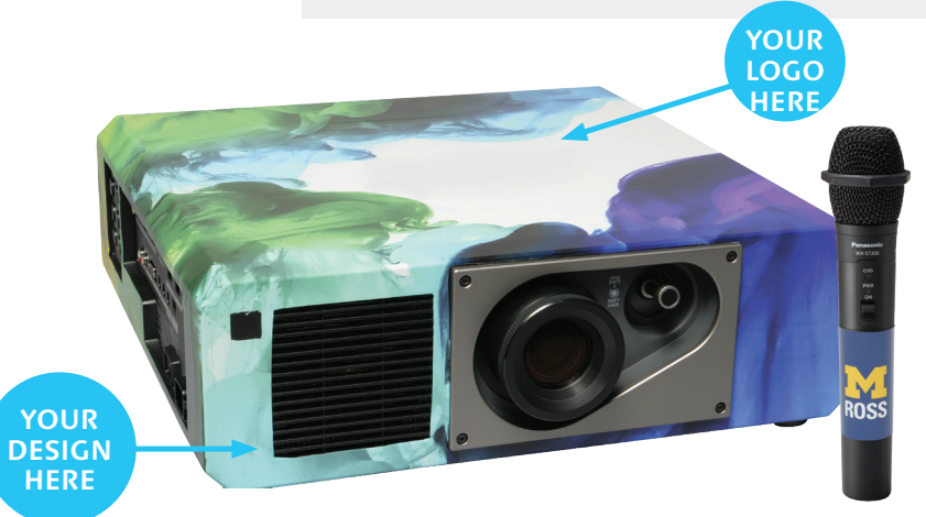
Microphone Skins are User Applied