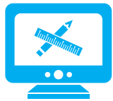
Research & Design

Panasonic controls virtually the entire manufacturing process for TOUGHBOOK mobile devices. That's practically unheard of for other device manufacturers.