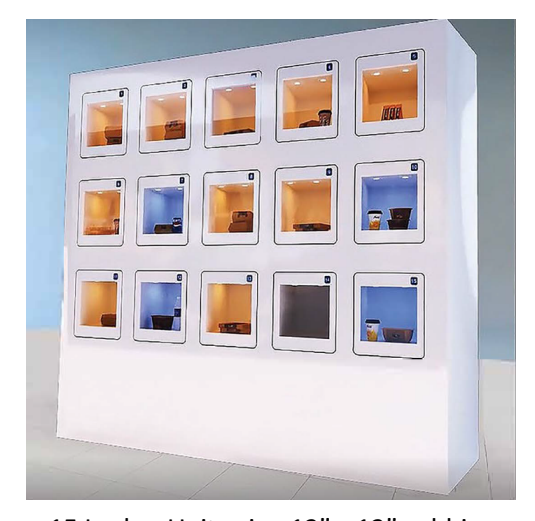
15 Locker Unit using 12" x 12" cubbies