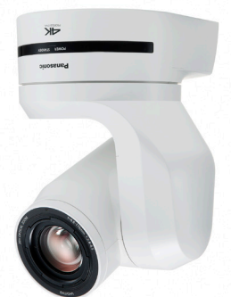
AW-UE150 integrated 4K/HD PTZ camera features a 4K/UHD 60p video output and a wide 75.1-degree viewing angle.