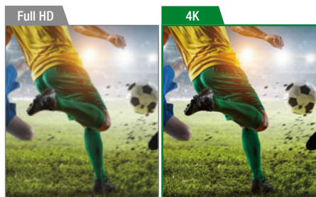
*Select the Picture mode to match the content.

An ATSC/NTSC tuner is built-in, providing highly precise 4K images. A Sports mode is also newly equipped, ideal for live sports relays with dynamic images. In addition, the narrow bezels allow better concentration on the screen.