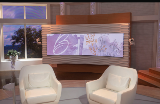
Set of "Better Together" at Tustin facility